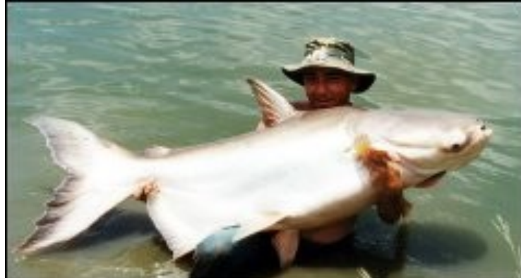
A Mekong Catfish

times had to 6lb T.C. rod tip bent parallel to the butt! We landed all manner of fish including pirania, giant suckerfish, mud carp, small headed-chowprior rover carp and sawai. After 3 days of constant action I decided to try for the real kippers, the legendary Arapima. We had a specimen of about 10 feet in